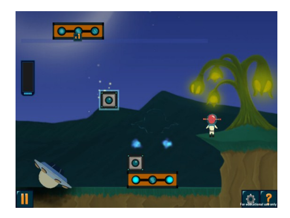
Figure 1. RumbleBlocks is a game where players must construct a tower high enough to reach the alien while also covering all of the blue energy balls.

Copyright © 2013 ACM 978-1-4503-1899-0/13/04...$15.00.